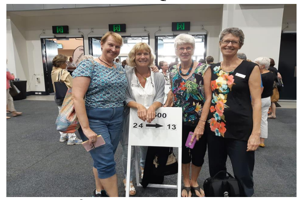
Ist & 2<sup>nd</sup> 0-500 MPs Butler Pairs